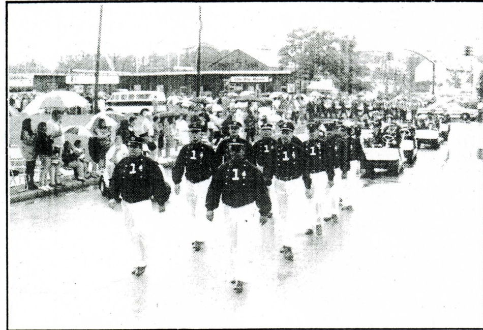
Members of Protection Engine Company No. 1 dressed in vintage uniforms march proudly in front of the reviewing stand during the parade honoring their 100th Anniversary.