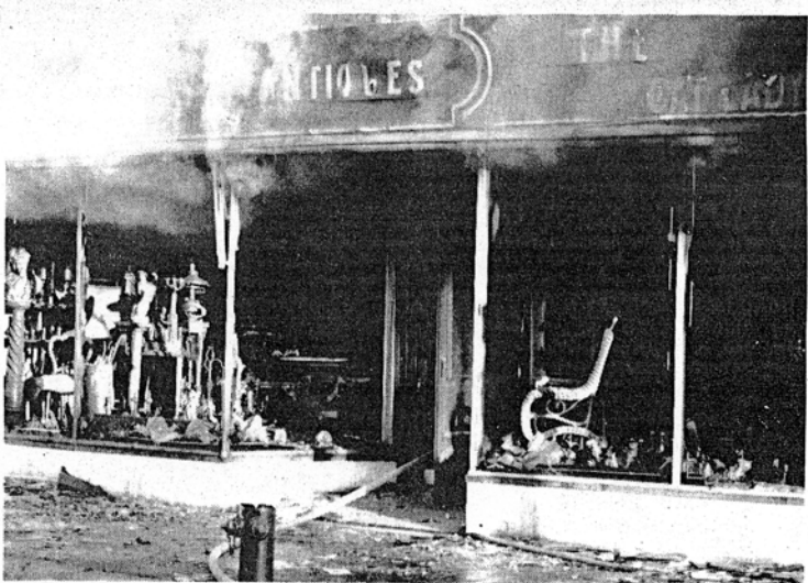
THE AFTERMATH.