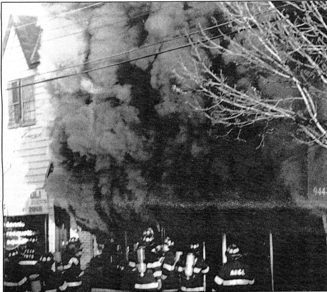
SMOKE POURS out of the building at 165 Main Street, known as "The Cat Lady Antiques" at 7:30 in the morning when the fire first began.