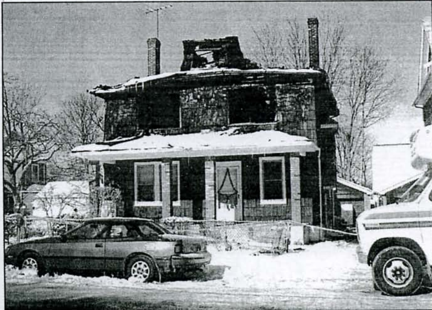
The fire, which broke out just before midnight last Friday night, engulfed the second and third floors of the house, causing a collapse of the third floor as well as the front dormers.